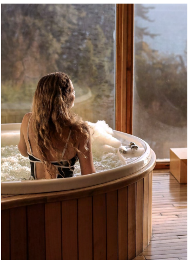
Design Calafate offers rooms with flat-screen cable TV and large windows that let in plenty of light. Some suites have whirlpool and panoramic views of the lake. The establishment houses an a la carte restaurant and a bar serving food and drinks from morning until late at night.