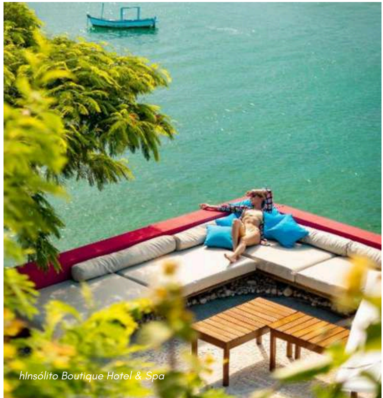
Insólito Boutique Hotel & Spa