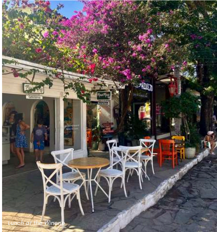
Lunch at the Wineria