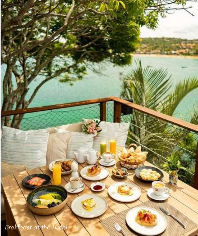
Breakfast at the Hotel

Enjoy a delicious breakfast at your hotel and then have your suitcases ready because a private transport will take you from the hotel to the airport. (approximately 3 hours by car). Once you arrive at the airport, you will have your international flight back home!