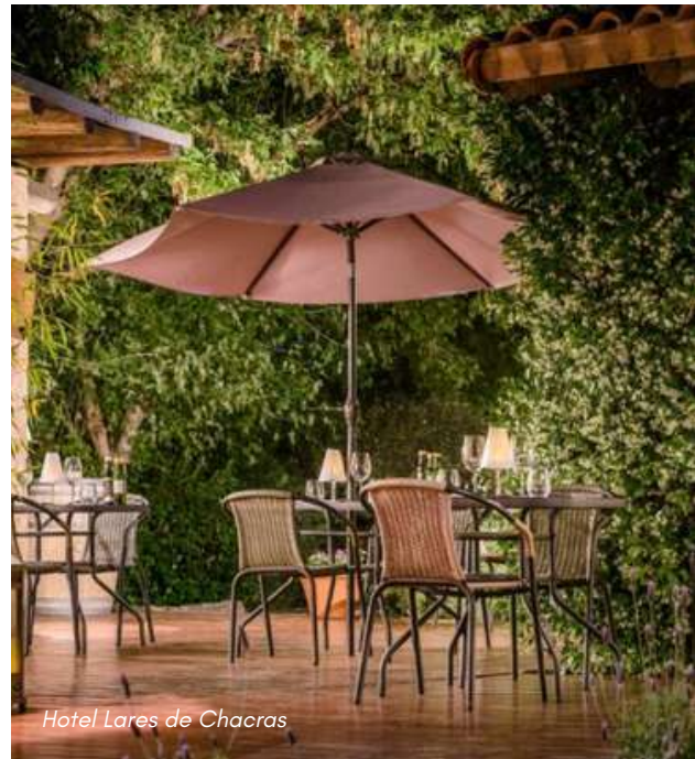
Hotel Lares de Chacras