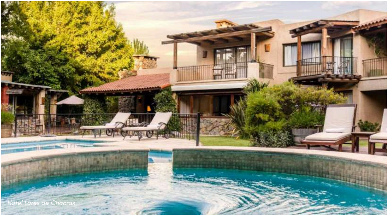
Hotel Lares de Chacras