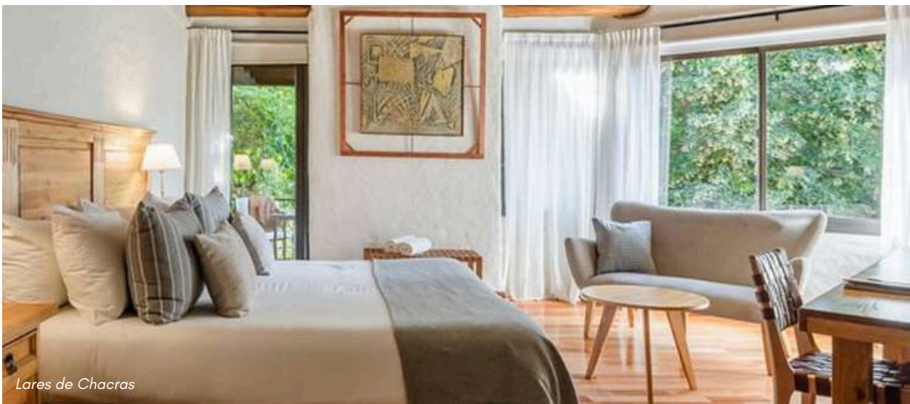
Lares de Chacras