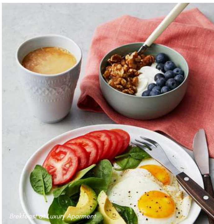
Breakfast at Luxury Apartment

As every morning, you will have your fabulous breakfast as soon as you wake up. These will be your last hours enjoying the Luxury Apartment, so make the most of it! Have everything ready because you will be taken to EZE to catch your international flight and return home!