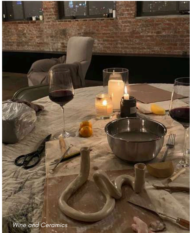
Wine and Ceramics